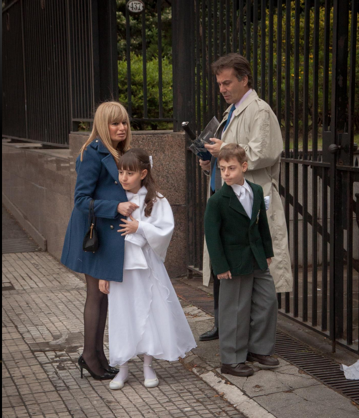
Buenos Aires, Argentina