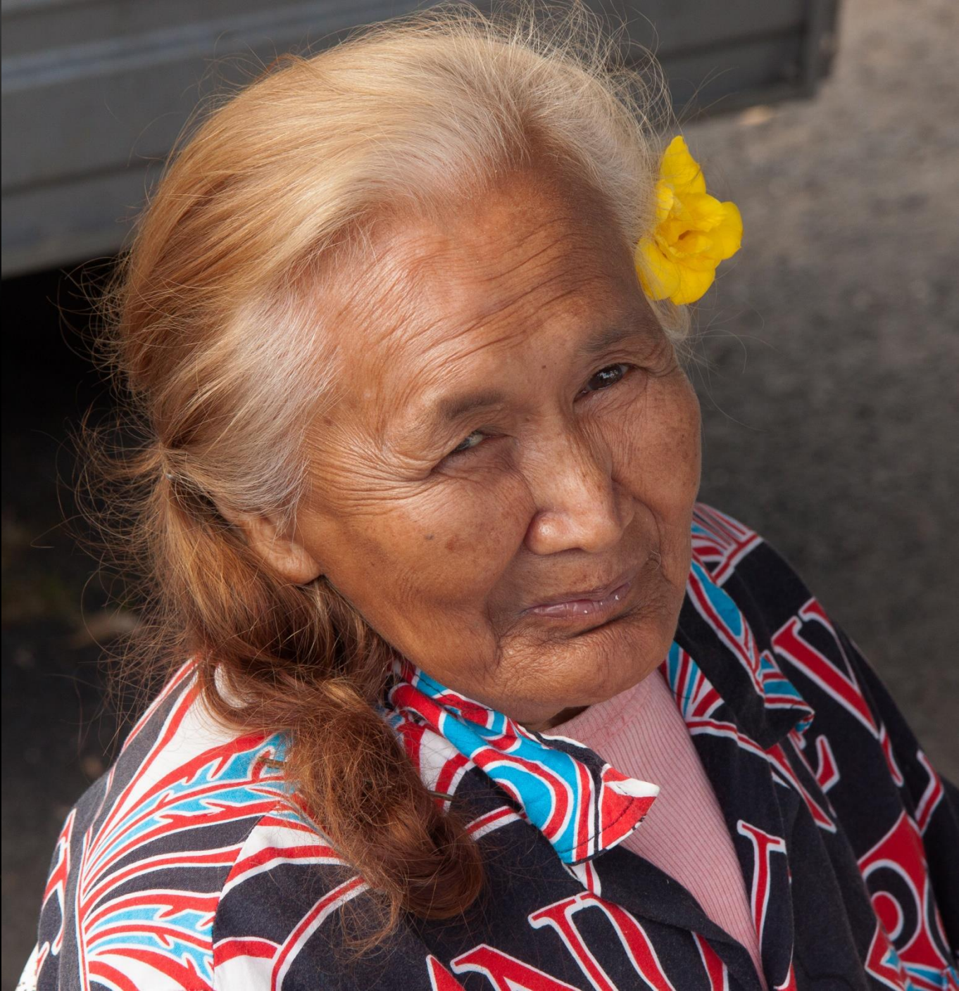
Rarotonga, Cook Islands