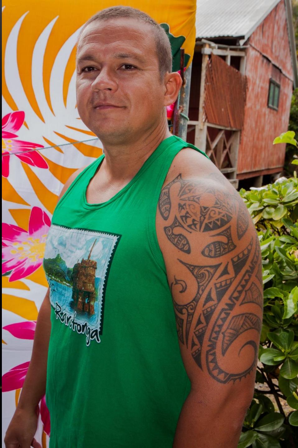
Rarotonga, Cook Islands