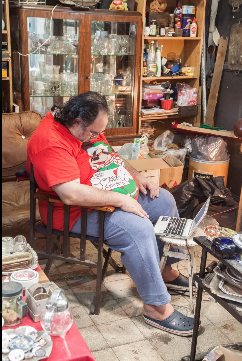
Buenos Aires, Argentina