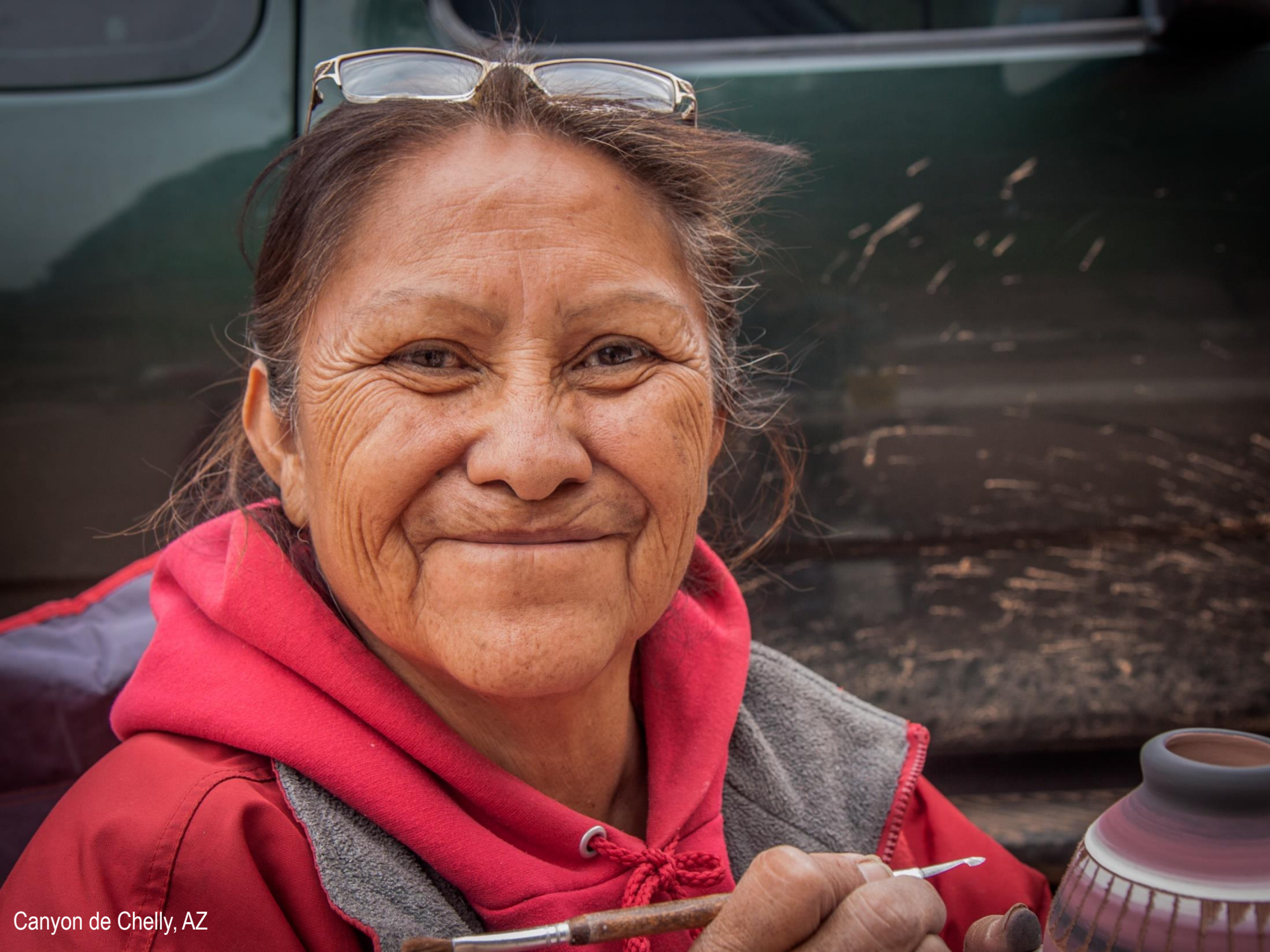
Canyon de Chelly, AZ