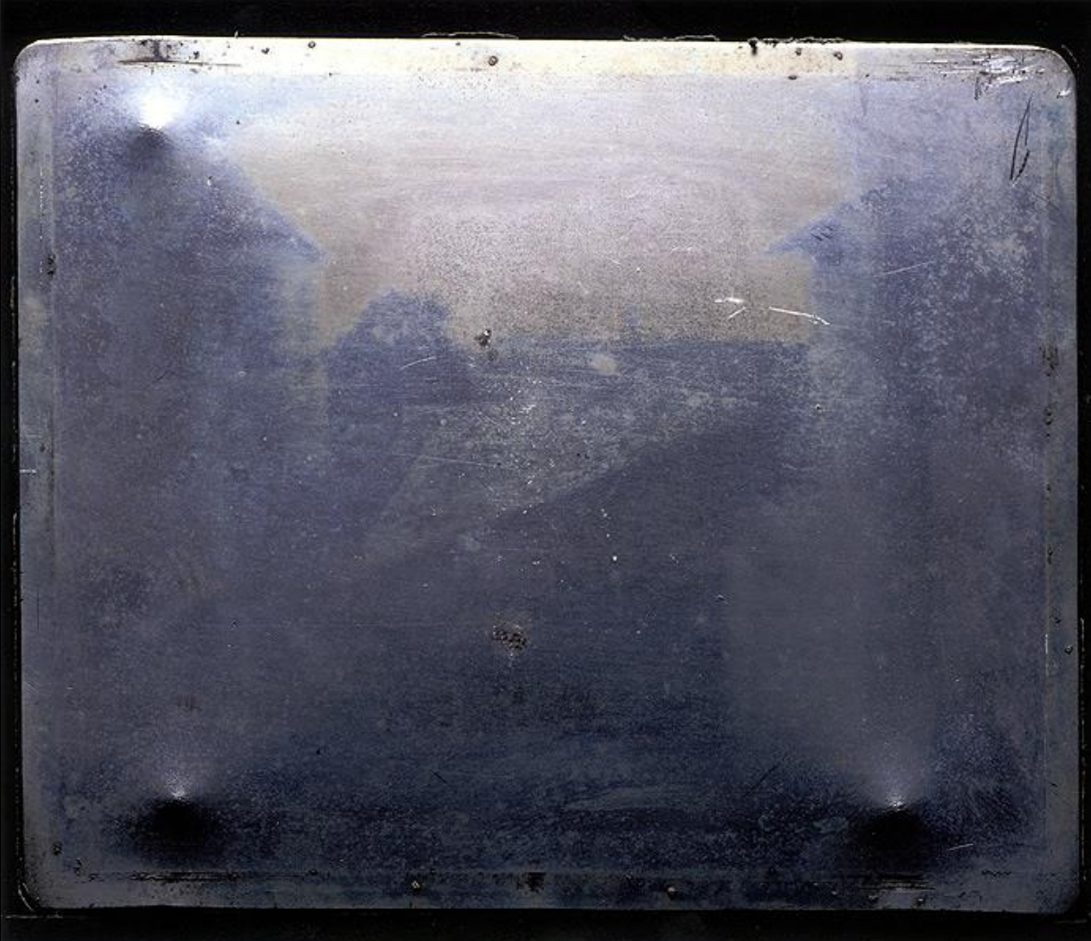
Joseph Nicéphore Niépce's View from the Window at Le Gras . 1826 or 1827