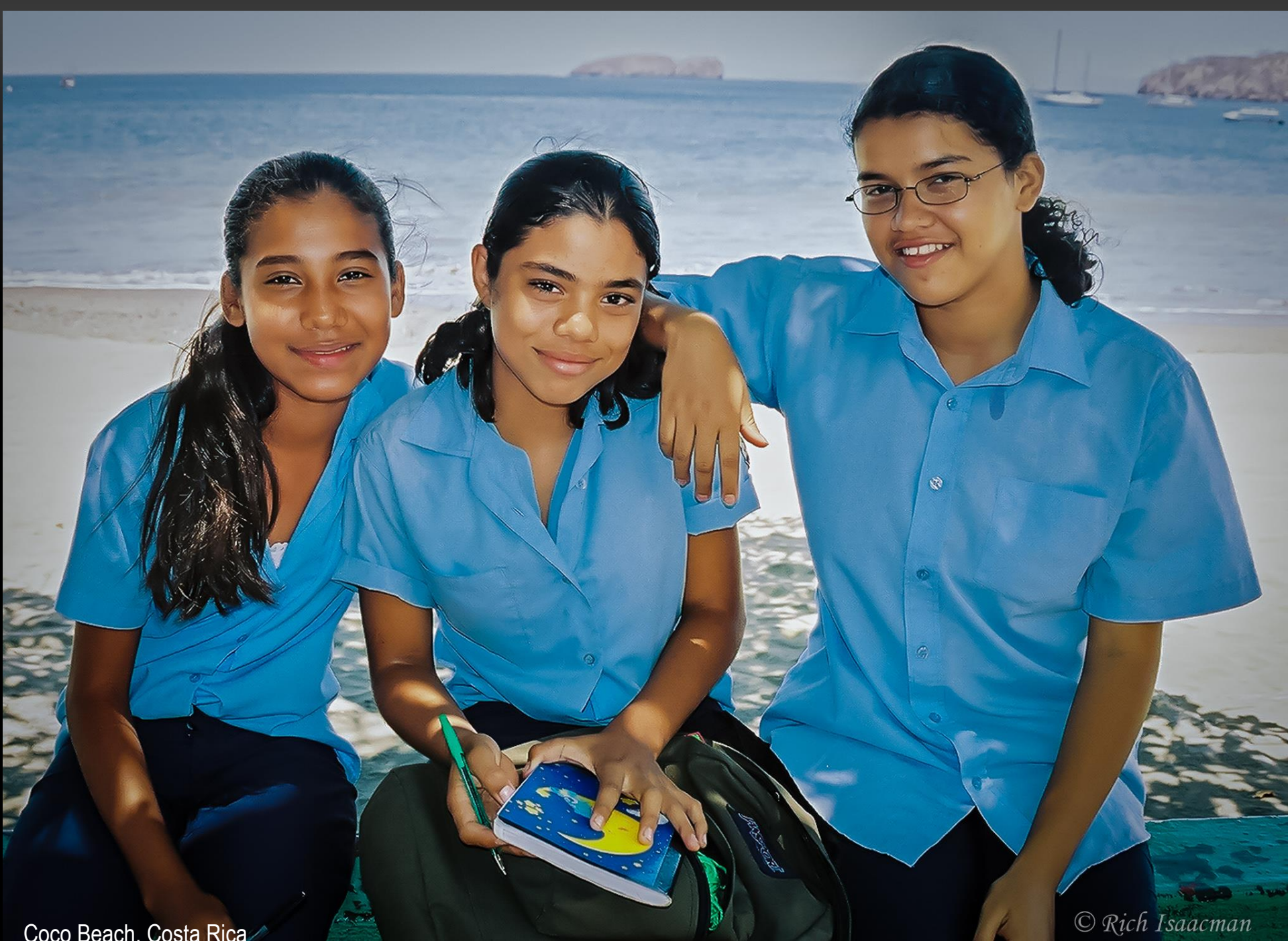
Coco Beach, Costa Rica