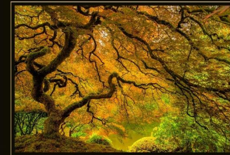
George Sass "Portland Japanese Garden"

Showing from February 3 through March 24