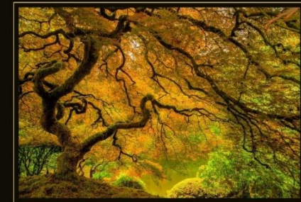
George Sass "Portland Japanese Garden"

Showing from February 3 through March 24