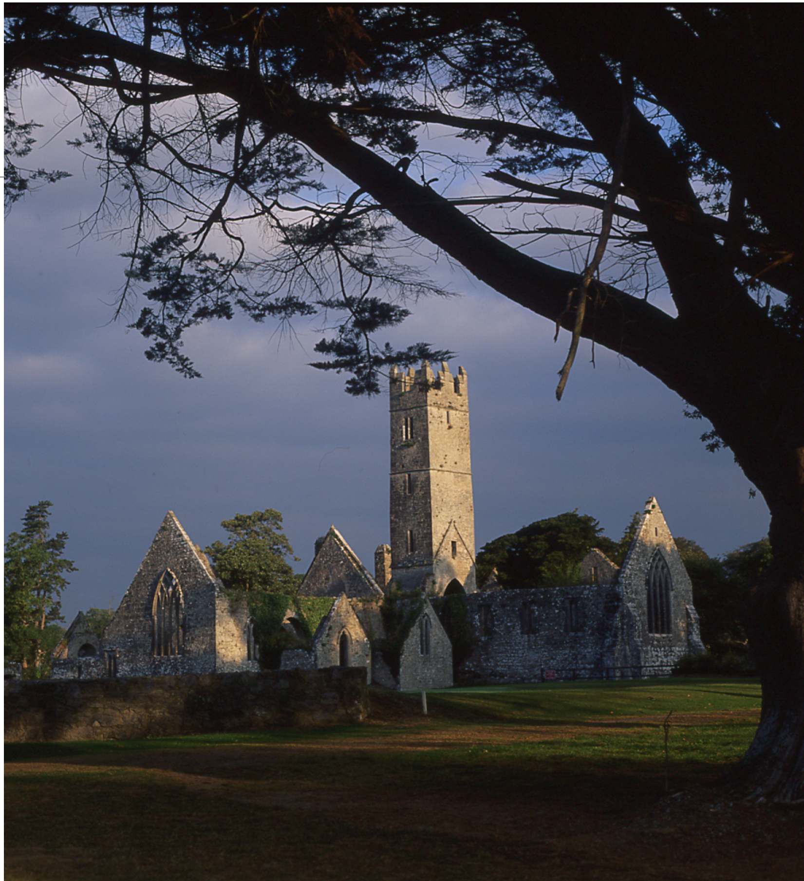
Medium Format, 1996, Ireland