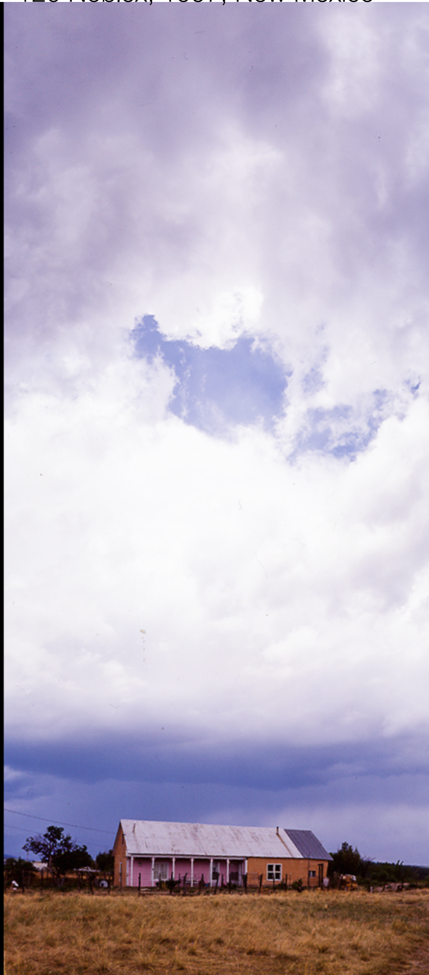
120 Noblex, 1997, New Mexico