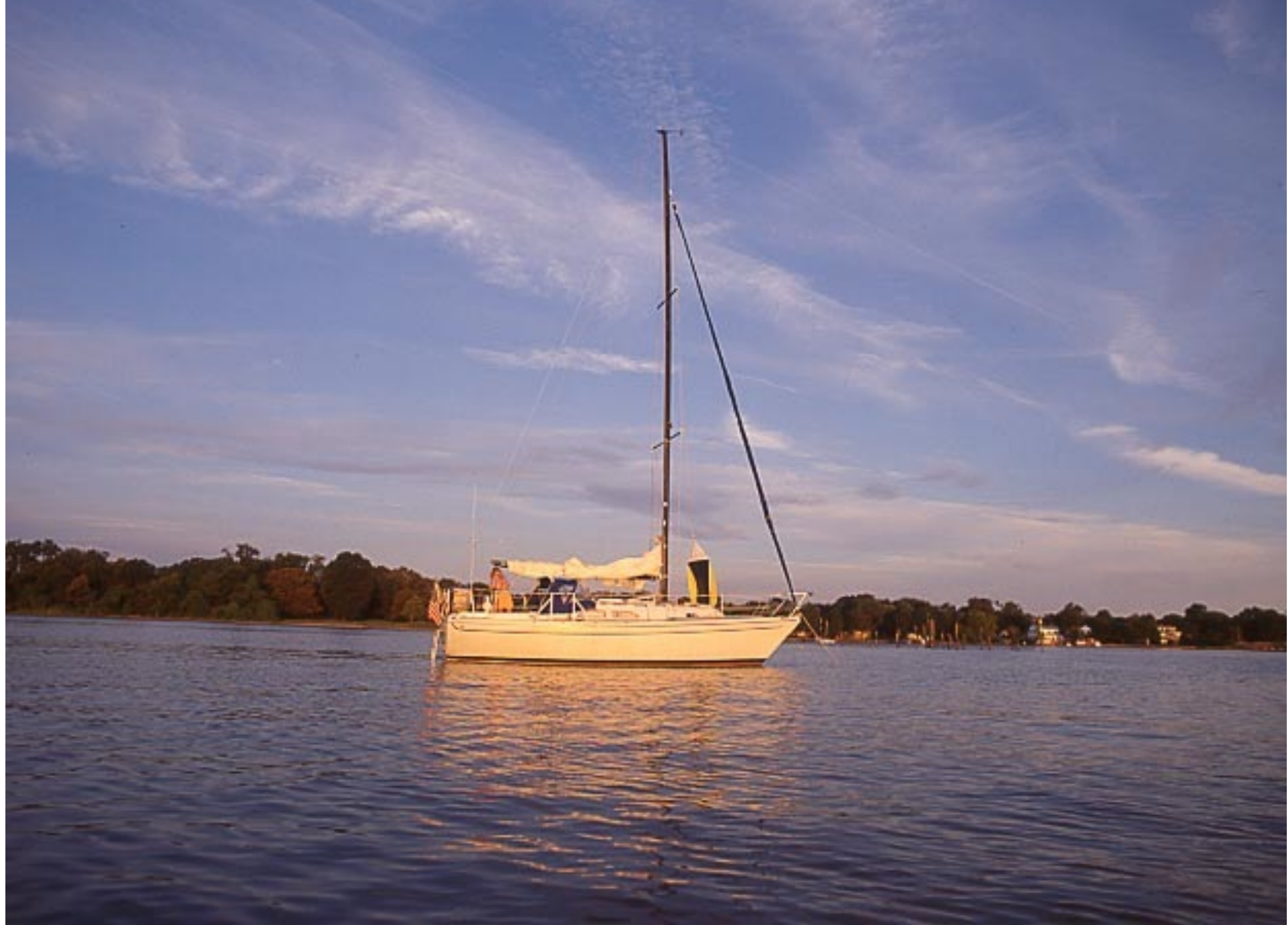
Medium Format, 1994, Chesapeake Bay