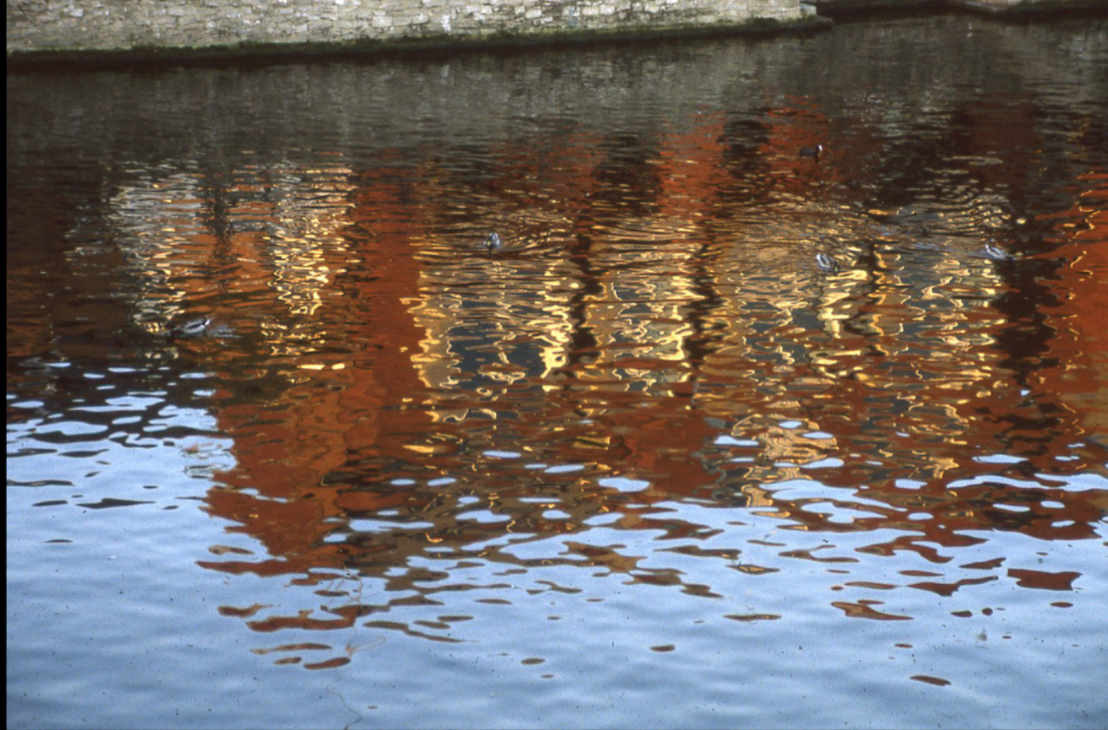
DSLR, 2012, Ego Alley, Annapolis