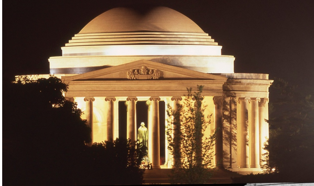
35mm, 2001, Jefferson Memorial