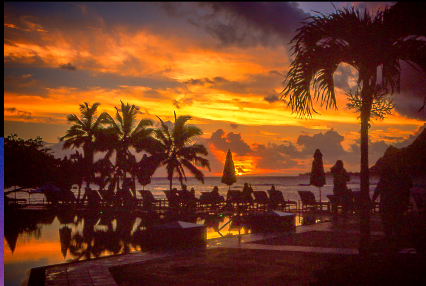
35mm, 1997, Hawaii