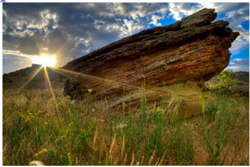
Winged Rock - Jim Harmer

You have all undoubtedly heard of the 365 project. The project encourages photographers to get out and take one picture every single day, and then to post that photo online. It is a fantastic way to improve your shooting skills; HOWEVER, I have seen so many 365 projects lately that I am beginning to wonder whether so many photographers are doing it because they want to improve their skills, or whether they are all doing it simply because they haven't discovered the unlimited number of creative photo projects that can be done.