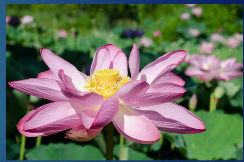
Lotus at Kenilworth Gardens