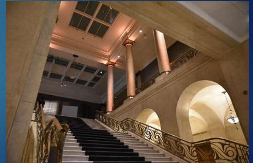
Montreal 24 70 Ego Alley