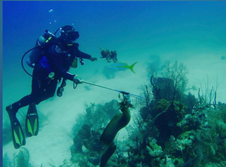
Underwater Photography Long-Term Project image by Al Gruber