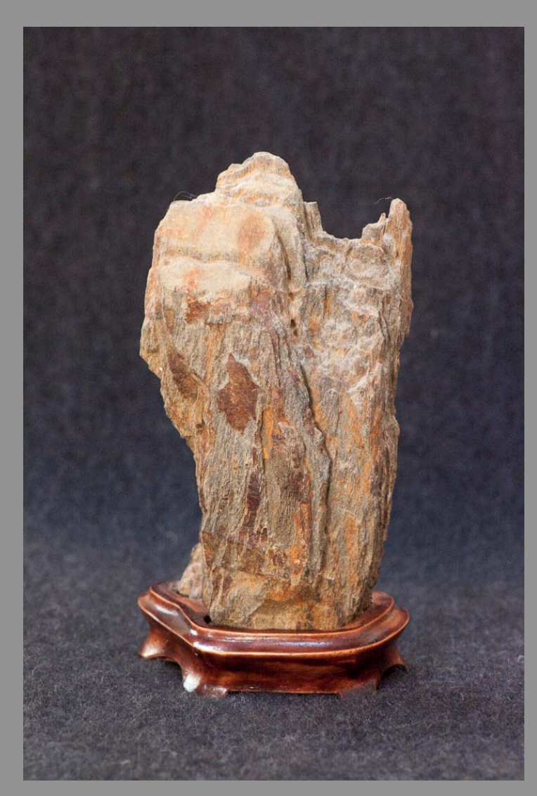
1/15sec at f/16 ISO 6400