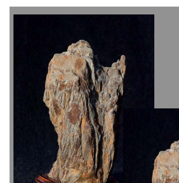
1/45 sec at f/22 ISO 6400