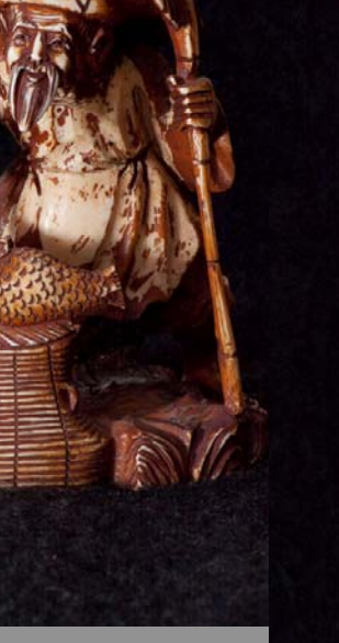
1/60 sec at f/22 ISO 6400