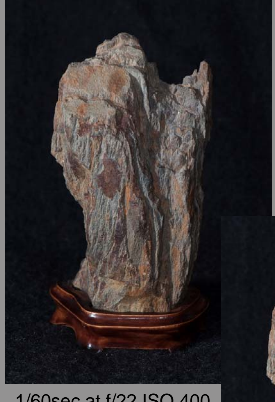
1/60sec at f/22 ISO 400