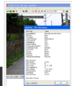
Showing geotag information in a JPEG-photo using the software IrfanView

These three tags would indicate that the camera is pointed heading 225° (south west), has a 45° tilt and is 560 metre from the subject. Both Panoramio (which is focused on showing geotagged pictures of the world) and Flickr , has the generated and place a picture from JPEG-metadata coordinates (as described above).